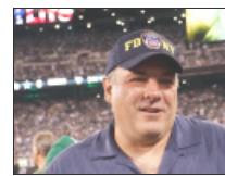
Remembering James Gandolfini