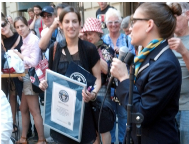
The world record for Largest Keyboard Ensemble is broken in Greenwich Village – June 21, 2013

The record breaking event was a kickoff for the Make Music New York festival, now in its seventh year.