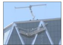
Scaffold Collapse At Hearst...