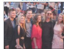
'World War Z' Premiere